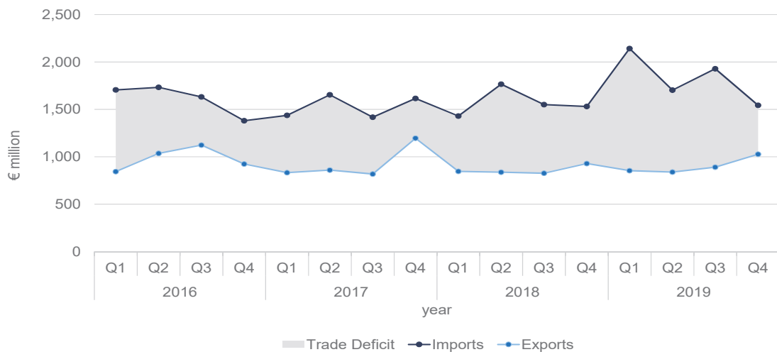
Chart 1. International Trade in Goods - quarterly

For 2019, imports from the European Union reached €4,821.5 million, or 65.9 per cent of total imports. There was a decrease of €312.8 million in imports from euro area countries when compared to 2018. Main increases and decreases in imports were registered from the United Kingdom (€840.2 million) and Italy (€207.9 million) respectively. With respect to exports, the main increase was directed to Germany (€69.0 million), whereas Japan (€83.8 million) registered the highest decrease (Table 3) ■