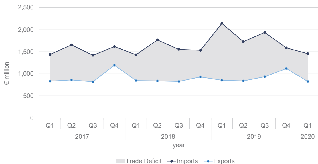
Chart 1. International Trade in Goods - quarterly

Imports from the European Union reached €714.7 million, or 49.1 per cent of total imports. There was a decrease of €15.0 million in imports from euro area countries when compared to the same period in 2019. Main increases and decreases in imports were registered from China (€88.9 million) and the United Kingdom (€652.2 million) respectively. With respect to exports, the main increase was directed to Germany (€32.5 million), whereas Italy (€43.1 million) registered the highest decrease (Table 3) ■