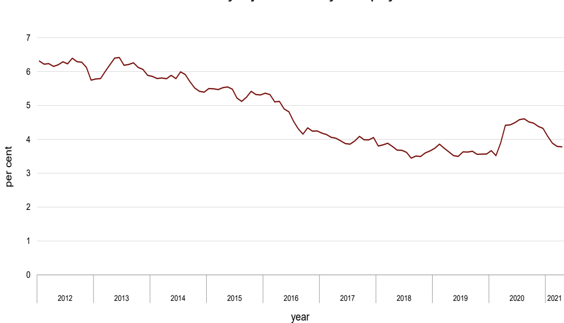
Chart 1. Seasonally adjusted monthly unemployment rate

Note: Data for reference years 2012-2020 is on annual basis; data for reference year 2021 is from January to March.