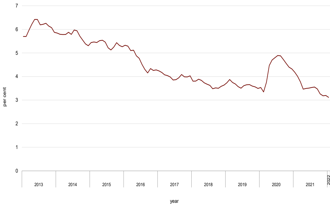
Chart 1. Seasonally adjusted monthly unemployment rate

Note: Data for reference years 2013-2021 is on annual basis; data for reference year 2022 is for January only.