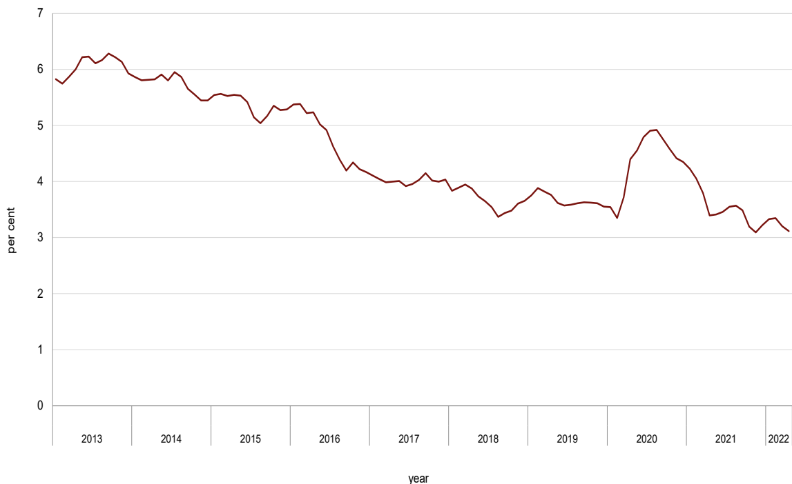
Chart 1. Seasonally adjusted monthly unemployment rate

Note: Data for reference years 2013-2021 is on annual basis; data for reference year 2022 is for January to April.