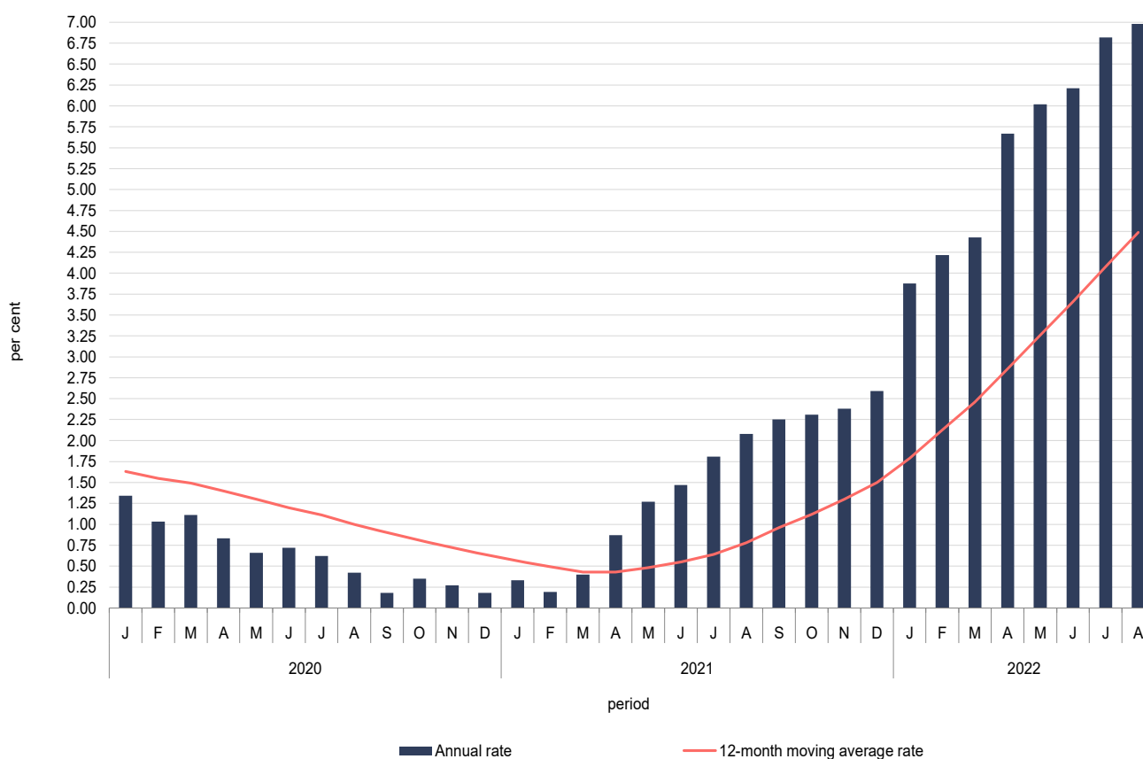
Chart 1. Inflation rates